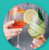
Delivered to your table