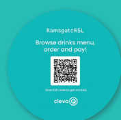
Scan QR Code at table