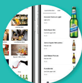
Browse the menu